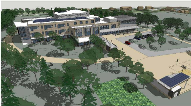
C1 VIEW FROM SW