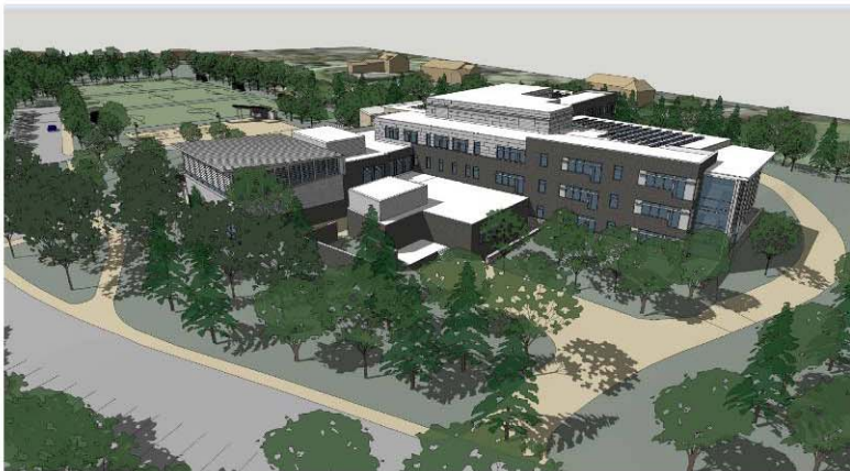
A1 VIEW FROM NE