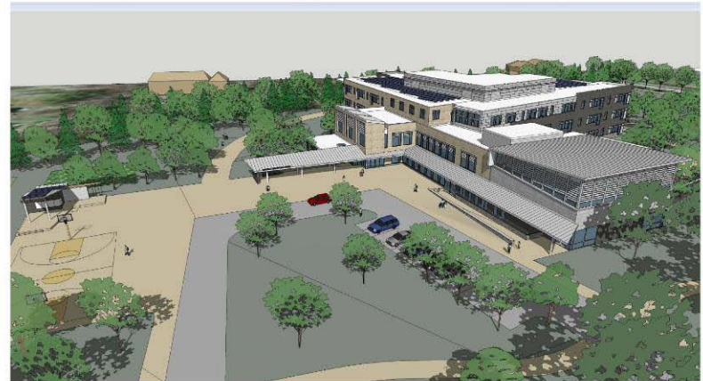
C2 VIEW FROM SE