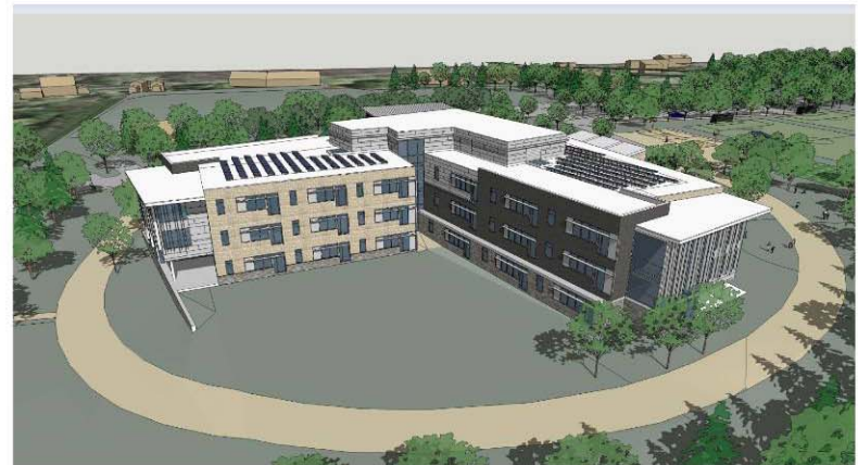
A2 VIEW FROM NW