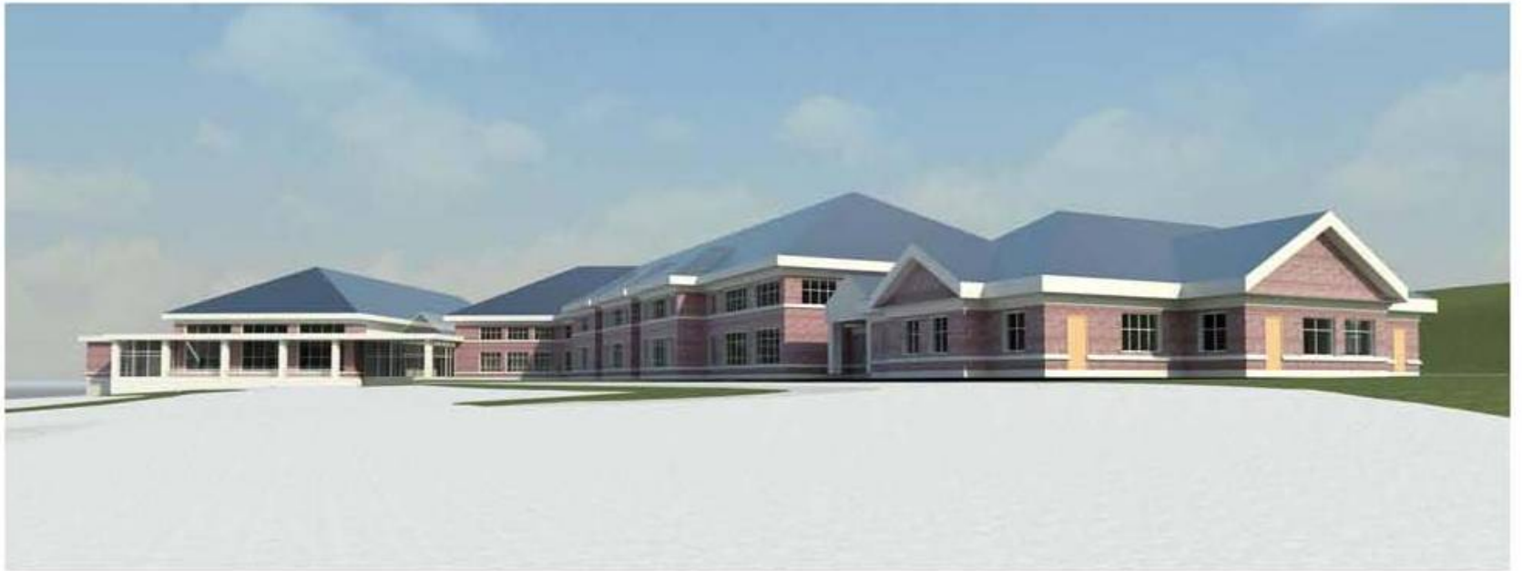
View of West Entry