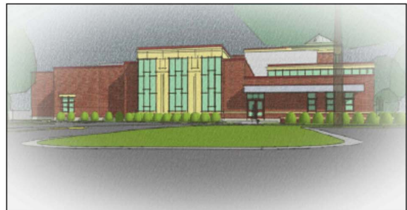
View towards Cafeteria