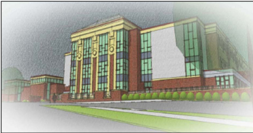
View towards Main Entrance