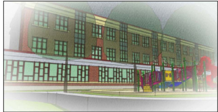
View towards Classrooms