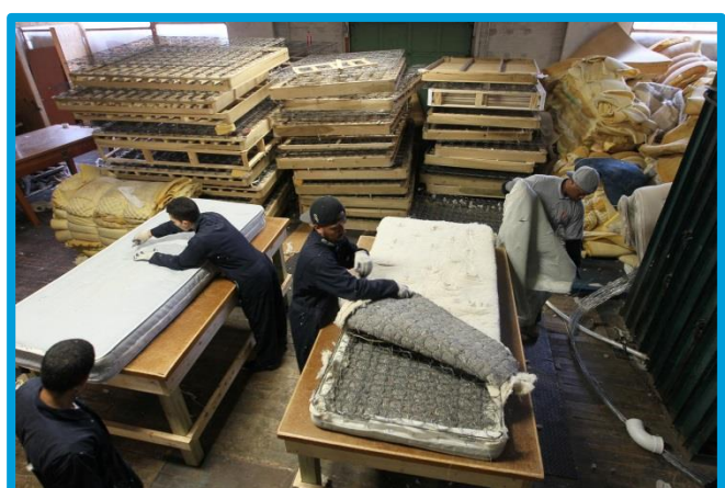
Mattress Recycling Grants